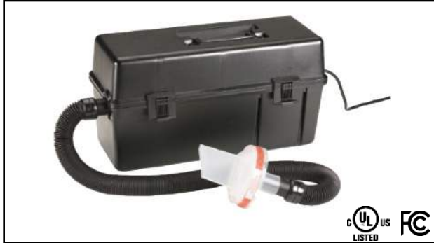
Figure 1. 497AJW Small Particle Collection Vacuum.