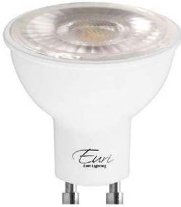
Available only as a twin-pack. (EP16-7W5000eG-2 contains 2 LED Bulbs.)

LED EP16-7W5000eG-2 delivers superior brightness, valuable energy savings, and long-lasting performance. This PAR16 LED bulb is ideal for ambient lighting or general-purpose applications due to its uniform *Soft White Light (3000K) and replaces conventional 50 Watt incandescent light bulbs. Look for EP16-7W5020eG-2 for Warm White (2700K), EP16-7W5040eG-2 for Bright White (4000K), and EP16-7W5050eG-2 for Cool White (5000K).