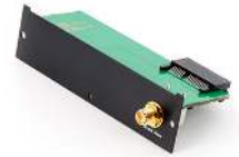
4-Port Ethernet Expansion Card