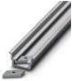
DIN rail, deep drawn, high profile, unperforated, 1.5 mm thick, material: aluminum, height 15 mm, width 35 mm, length 2000 mm

DIN rail, unperforated - NS 35/15 AL UNPERF 2000MM - 1201756