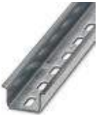
DIN rail, material: Galvanized, perforated, height 15 mm, width 35 mm, length: 2 m

DIN rail perforated - NS 35/15 ZN PERF 2000MM - 1206599