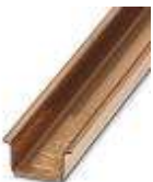
DIN rail, material: Copper, unperforated, 1.5 mm thick, height 15 mm, width 35 mm, length: 2 m

DIN rail, unperforated - NS 35/15 CU UNPERF 2000MM - 1201895