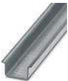
DIN rail, material: Galvanized, unperforated, height 15 mm, width 35 mm, length: 2 m

DIN rail, unperforated - NS 35/15 ZN UNPERF 2000MM - 1206586