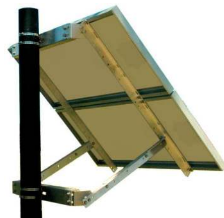
160W and 320W Kit Mount System