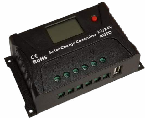
12V / 24V Intelligent Solar Charge Controller