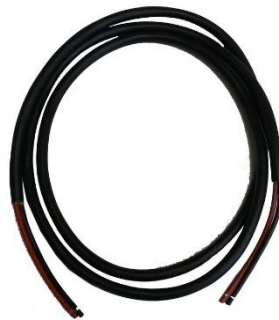
20' Outdoor Rated 12AWG Cable