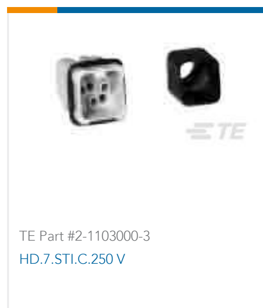
TE Part #2-1103000-3 HD.7.STI.C.250 V