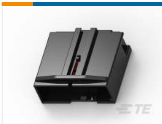
TE Part #1563308-2 24POS, MIXED,PIN HSG,ASSY