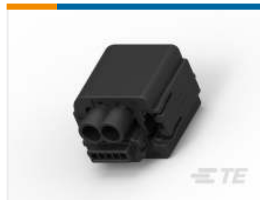
TE Part #1732175-2 2+5 Sealed Connector Ass'y