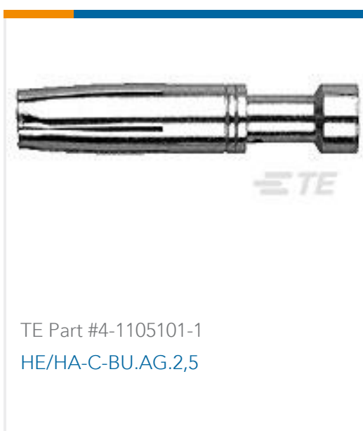
TE Part #4-1105101-1 HE/HA-C-BU.AG.2,5