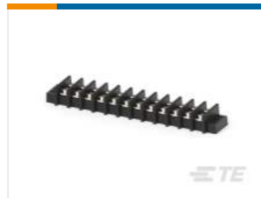
TE Part #1-1776544-2 12P .563" DR, 600V