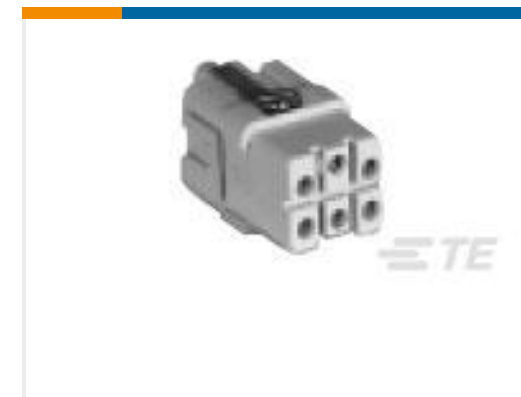
TE Part #1102194-1 HE.Q5.BU.C