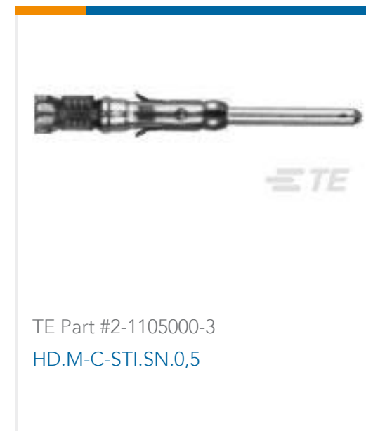
TE Part #2-1105000-3 HD.M-C-STI.SN.0,5