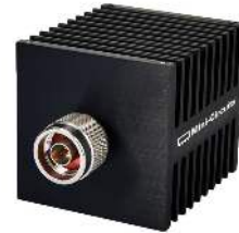
CASE STYLE: LL2798-2