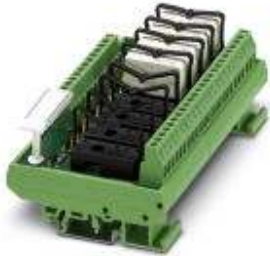
VARIOFACE module, for 8 plug-in miniature relays or miniature optocouplers, with LED, 5 V DC input voltage

Please be informed that the data shown in this PDF Document is generated from our Online Catalog. Please find the complete data in the user's documentation. Our General Terms of Use for Downloads are valid ( http://phoenixcontact.com/download )