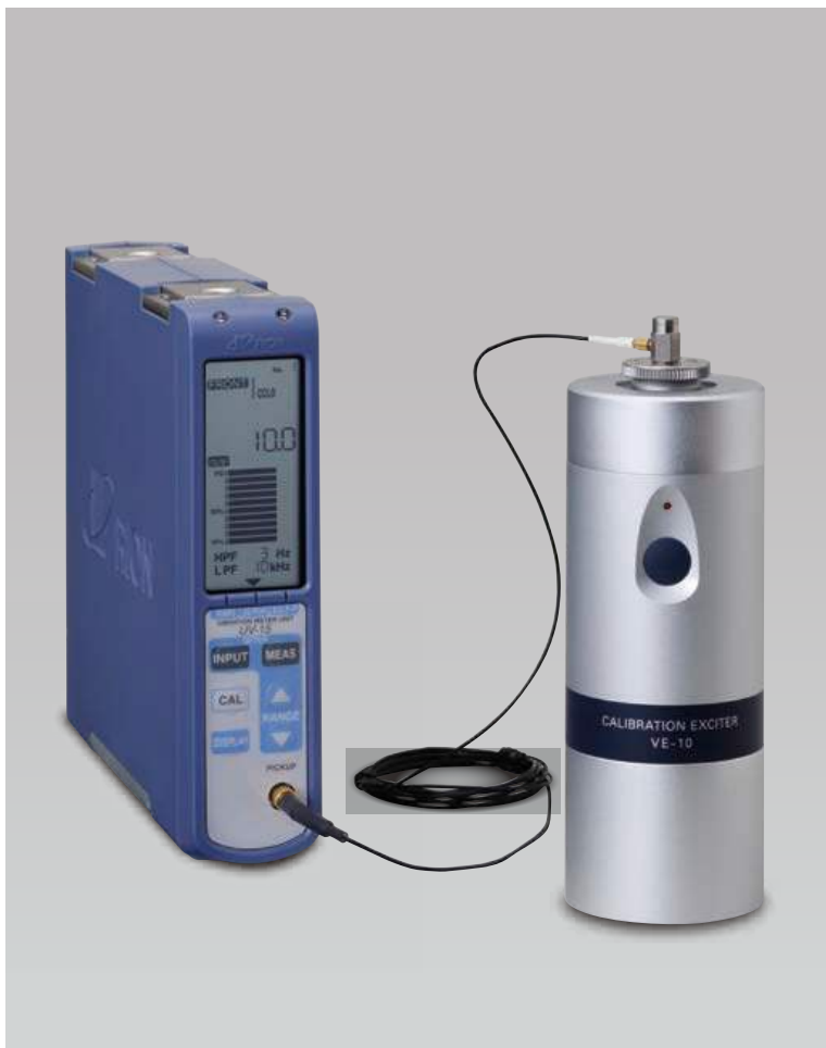
Calibration of Vibration Level Meter Unit UV-15 by VE-10