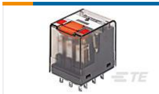
TE Part #3-1415020-1 PT570N20