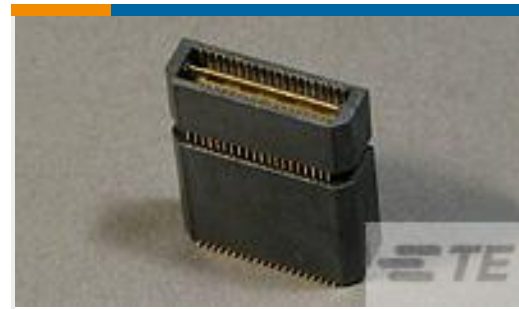
TE Part # 1-1658469-1 MSB0.80PL25ASY28DP,-,30,VCTY