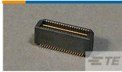
TE Part # 1-1658464-1 MSB0.80PL8ASY28DP,-,30,VCTY