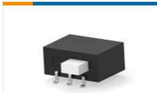
TE Part #1-1437581-1 ASE22RL=AUTOSLIDE DP