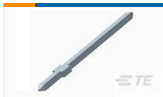
TE Part #1-928836-2 MOD2 PIN WITH A-PIN L/P