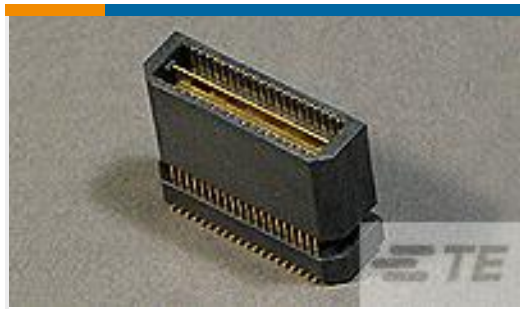
TE Part # 1-1658466-1 MSB0.80PL16ASY28DP,-,30,VCTY