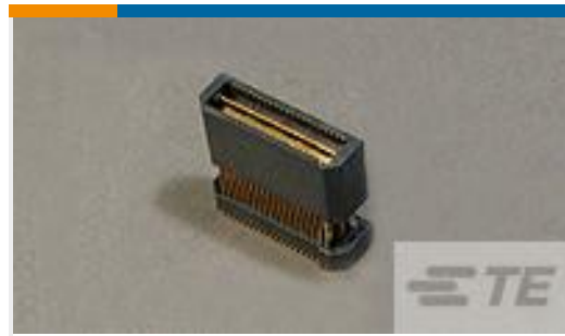
TE Part # 1-1658467-1 MSB0.80PL19ASY28DP,-,30,VCTY