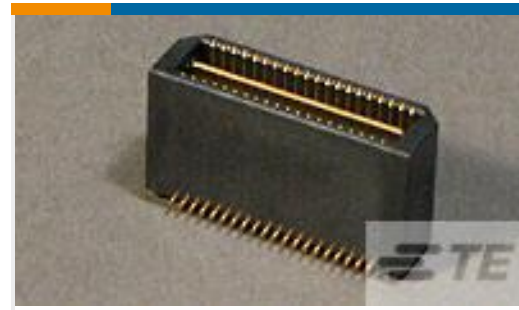
TE Part # 1-1658465-1 MSB0.80PL11ASY28DP,-,30,VCTY