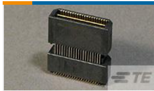
TE Part # 1-1658468-1 MSB0.80PL22ASY28DP,-,30,VCTY