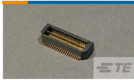
TE Part # 1-1658463-1 MSB0.80PL5ASY28DP,-,30,VCTY