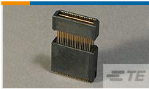
TE Part # 1-1658470-1 MSB0.80PL30ASY28DP,-,30,VCTY