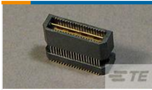
TE Part # 1-1658439-1 MSB0.80PL14ASY28DP,-,30,VCTY