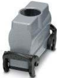
HEAVYCON B24 coupling housing, with double locking latch, height: 81.5 mm, with 1 x M40 thread, straight cable outlet

Please be informed that the data shown in this PDF Document is generated from our Online Catalog. Please find the complete data in the user's documentation. Our General Terms of Use for Downloads are valid ( http://download.phoenixcontact.com )