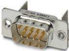
D-SUB contact insert, shell size 1, with nine signal contacts, contact type pin, for PCB assembly, angled, fixing with a 2.5 mm hole and solder metal plate, for panel mounting frame VS-09-...

Please be informed that the data shown in this PDF Document is generated from our Online Catalog. Please find the complete data in the user's documentation. Our General Terms of Use for Downloads are valid ( http://phoenixcontact.com/download )