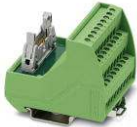
VARIOFACE sensor module, for connecting 8 pnp sensors, with LED

Please be informed that the data shown in this PDF Document is generated from our Online Catalog. Please find the complete data in the user's documentation. Our General Terms of Use for Downloads are valid ( http://phoenixcontact.com/download )