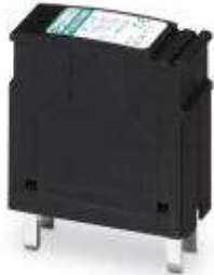
Protective plug PT with HF protective circuit for 4 signal wires. Nominal voltage: 12 V DC

Please be informed that the data shown in this PDF Document is generated from our Online Catalog. Please find the complete data in the user's documentation. Our General Terms of Use for Downloads are valid ( http://download.phoenixcontact.com )