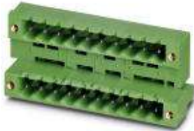
The figure shows a 10-pos. version with 20 contacts

Please be informed that the data shown in this PDF Document is generated from our Online Catalog. Please find the complete data in the user's documentation. Our General Terms of Use for Downloads are valid ( http://phoenixcontact.com/download )