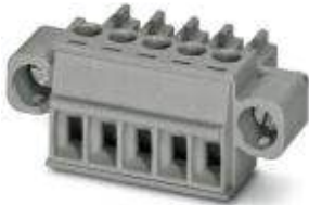
The figure shows a 5-pos. version of the product in gray

Plug component, Nominal current: 8 A, Rated voltage (III/2): 160 V, Number of positions: 9, Pitch: 3.5 mm, Connection method: Screw connection, Color: pastel green, Contact surface: Tin