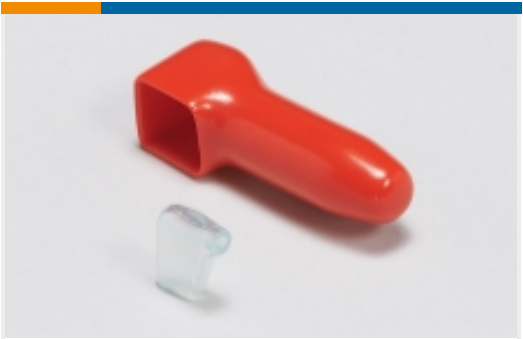
Insulation Boots & Sleeves(4)