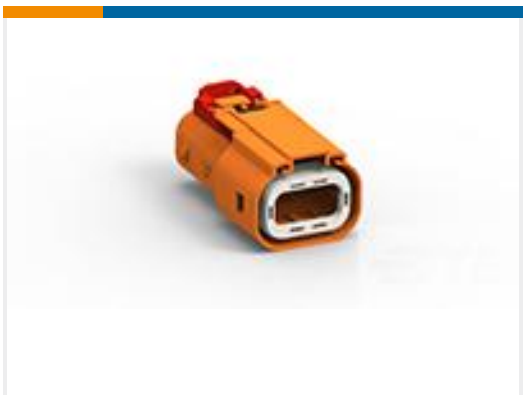
TE Part #4-2103015-2 PLUG SUBASSY, B, HVA280-2PHM F