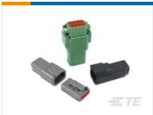
TE Part #DTM06-08SB DEUTSCH DTM Housings