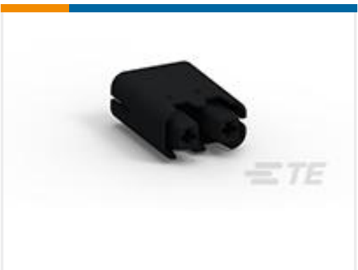
TE Part #1587977-2 INNER HOUSING, PLUG, HVA280-2PHM, PASS T