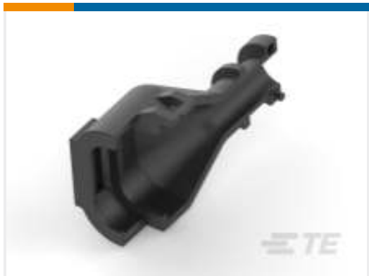
TE Part #2138529-1 STRAIN RELIEF, 8 POSITION AMPSEAL