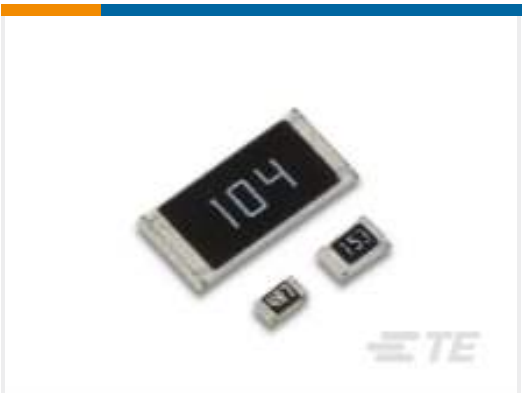
TE Part #1-2176349-6 CRGCO 2512 180R 1%