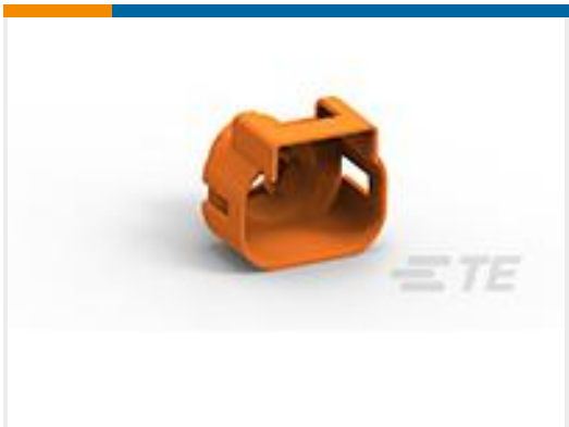
TE Part #2103013-1 CABLE SEAL RETAINER, SIZE 1, HVA280