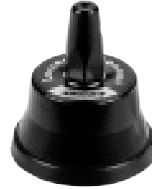
Black UHF base for NMO mounts