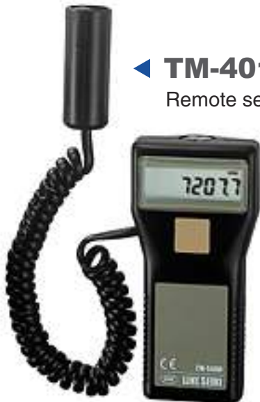
◀ TM-4015 Remote sensor