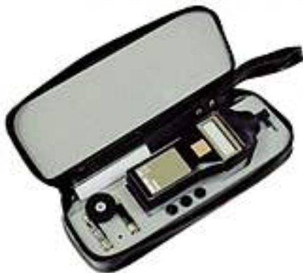
◀ TM-5000K/TM5000EK TM-5000 Kit models TM-5010K/TM-5010EK TM-5010 Kit models TM-5010E Kit models

All kit models includes the main unit, reflective tape, contact adapter, rubber tip, surface speed wheel, AAA batteries and carrying case.