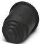
End sleeves, transition sleeves, from hose to cable

Transition sleeve from hose to cable - WP-EC TPE HF 15,8 BK - 3240976