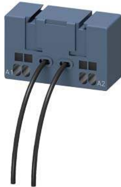
coil connection module connection from below, spring-loaded terminal, for contactors 3RT2.2