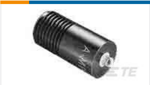
TE Part #830178-1 RECEPTACLE