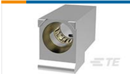
TE Part #2000713-5 RA Keyed Guide Mod, Vita 46, Machined