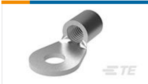
TE Part #322224 TERMINAL,SOLIS R 2/0 5/8