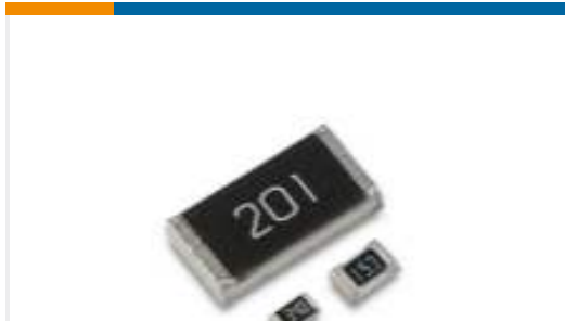
TE Part #4-2176329-9 CRGP 1210 100K 1%