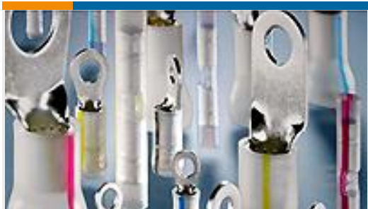
TE Part #53422-1 TERMINAL,PIDG PVF2 R 16-14 1/2