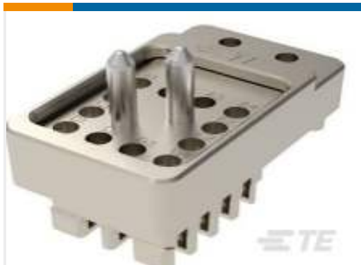
TE Part #2313376-1 NanoRF, BP, 12 POS, 67.3 D