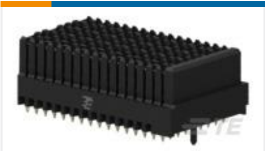
TE Part #2102737-1 BP, Right End, MULTIGIG RT 2R