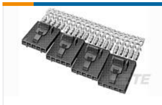
TE Part #5-103956-6 2X7 MTE RCPT SR LATCH .100CL