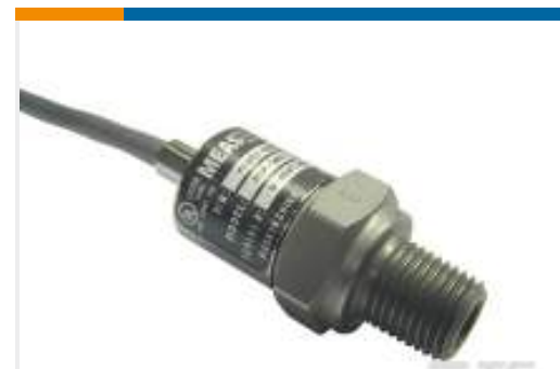
TE Part #M3021-000005-100PG PRESS XDCR M3021-000005-100PG