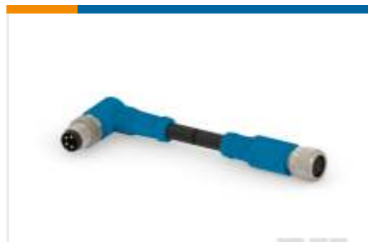
TE Part #T4062213004-005 RPC-M8-4MR-5.0SH-M8-4FS-PVC