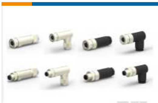
TE Part #T4011008041-000 M8 Field Installable