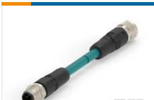
TE Part #TAD1453A201-001 M12D4-MS-FS-TPE-24SH-TEAL-0.5M