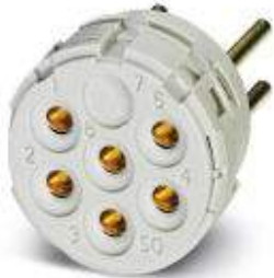
Contact insert, Number of positions: 6+3, Type of contact: Socket, Solder-in connection

Please be informed that the data shown in this PDF Document is generated from our Online Catalog. Please find the complete data in the user's documentation. Our General Terms of Use for Downloads are valid ( http://phoenixcontact.com/download )