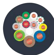
PUR halogen-free black [PUR]