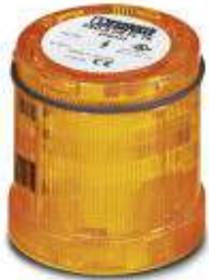
Flashing beacon element, 24 V DC, yellow, Xenon flash tube

Please be informed that the data shown in this PDF Document is generated from our Online Catalog. Please find the complete data in the user's documentation. Our General Terms of Use for Downloads are valid ( http://phoenixcontact.com/download )