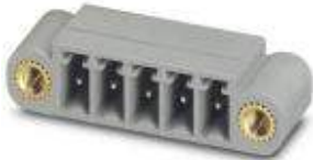
The figure shows the 5-pos. version of the product in gray

Header, Nominal current: 8 A, Rated voltage (III/2): 160 V, Number of positions: 15, Pitch: 3.5 mm, Color: black, Contact surface: Tin, Mounting: Wave soldering