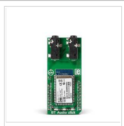
BT Audio click