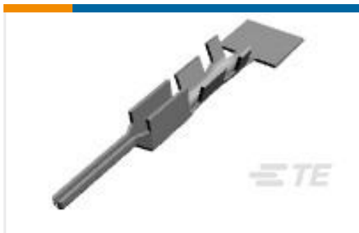
TE Part #1-794608-0 PIN CONT 20-24 TIN PLATE STRIP