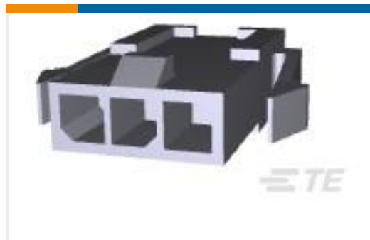
TE Part #1445048-3 PANEL MT SNGL ROW HSG 3 POS