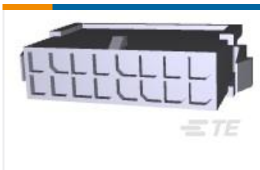
TE Part #1-794615-6 PANEL MT DBL ROW HSG 16 POS