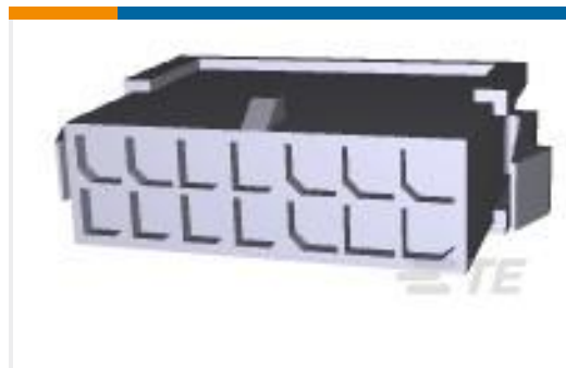
TE Part #1-794615-4 PANEL MT DBL ROW HSG 14 POS