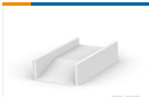
TE Part #171837-2 SPACER