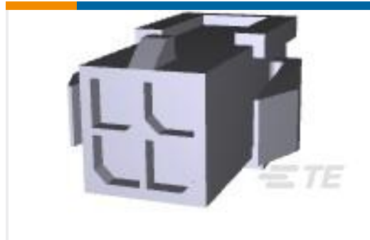
TE Part #794615-4 PANEL MT DBL ROW HSG 4 POS