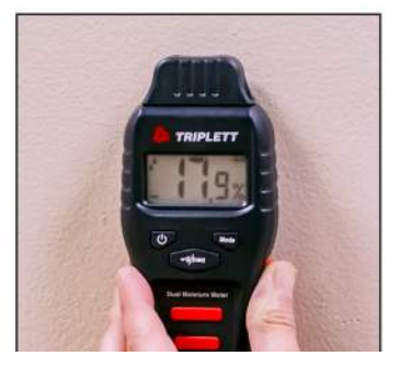
Moisture Meter (pin/pinless)