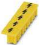
Warning cover, 5-pos., for terminal width: 5.2 mm