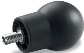
ERGOSTYLE® ELESA Original design

The coating, with "soft-touch" elastomer, improves the grip even in the presence of oils, greases and sweat from the hand. For this reason it is suitable for fitness machines, tools and machines for gardening and goods transport, high-precision instruments and disability aids.