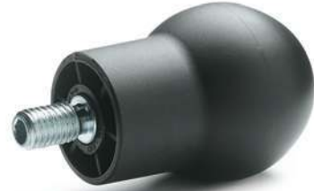
ERGOSTYLE® ELESA Original design