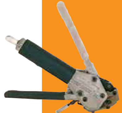
A40199 Tie-Dex® II Tool

Pre-calibrated tool applies Tie-Dex Micro Bands. Weight: 1.3 Lbs (0.6 Kg). Use the Calibration Key (A44699) to change calibration.