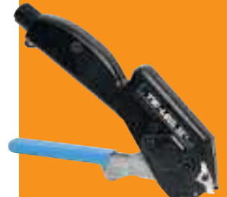
A92079 Tie-Lok II Tool Adjustable tension, forms lock, cuts off tail.