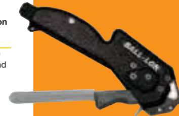
K50289 Ball-Lok Tool Adjustable tension, forms lock, cuts off tail.