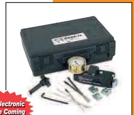
A50099 Tie-Dex® Calibration Kit

50 test bands. Weight: 0.1 Lbs (0.06 Kg).