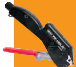
A91079 Mini Tie-Lok II Tool Adjustable tension, forms lock, cuts off tail.