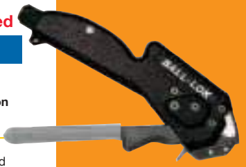
K50289 Ball-Lok™ Adjustable tension, forms lock, cuts off tail.