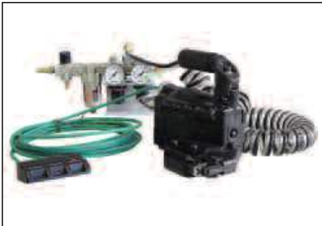
IT Series Tools