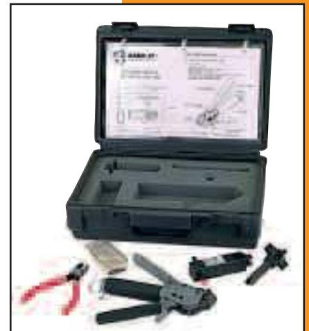
A49099 Tie-Dex® II Kit

Weight: 4.6 Lbs (2.0 Kg). Kit includes: 1-A30199, 1-A47599, 1-A44699, parts and cutters.