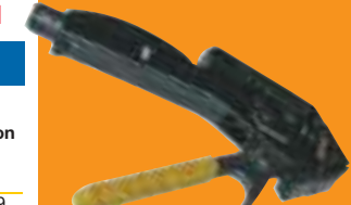
M50389 Multi-Lok Hand Tool Adjustable tension, forms lock, cuts off tail.