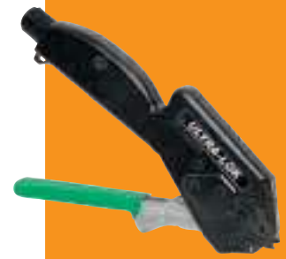
A94079 Ultra-Lok Tool Adjustable tension, forms lock, cuts off tail.