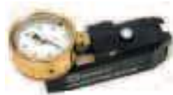
A50189 Tie-Dex® Calibration Device