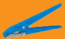
AE2009 Cable Tie Tensioner