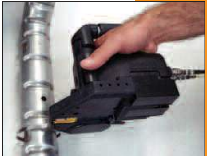
IT Series Tools