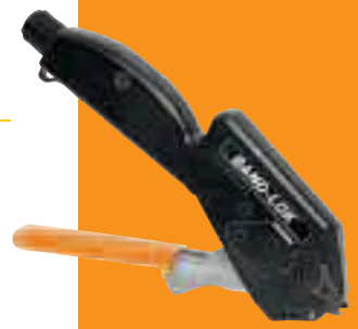
A95079 Band-Lok Tool Adjustable tension, forms lock, cuts off tail.