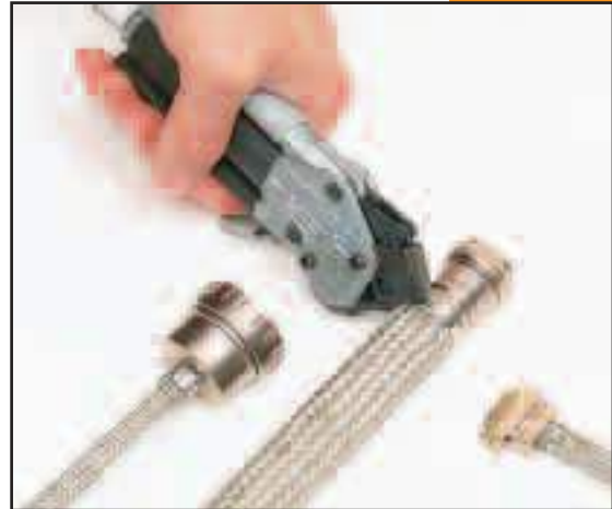
A40199 Tie-Dex II Tool