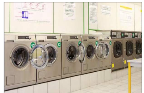
Laundry Equipment (washers and dryers)