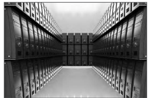
Server and Storage Room