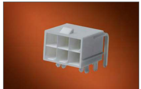
Mini-Fit® Plus Header