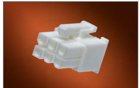
Mini-Fit® Plus Receptacle