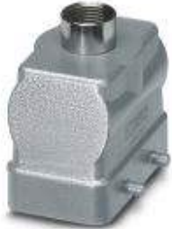
HEAVYCON B10 sleeve housing, for double locking latch, height: 56 mm, with 1 x Pg16 gland, straight cable outlet

Please be informed that the data shown in this PDF Document is generated from our Online Catalog. Please find the complete data in the user's documentation. Our General Terms of Use for Downloads are valid ( http://download.phoenixcontact.com )