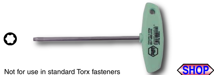
Not for use in standard Torx fasteners

364 TORXPlus® Screwdriver, With Wiha-T-handle Blade high alloy chrome-vanadium-molybdenum steel, hardened, hard chromed. Wiha-T-handle high quality plastic, impact resistant.