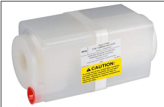
Figure 4. SCS SV-MPF2 Type 2 Replacement Filter