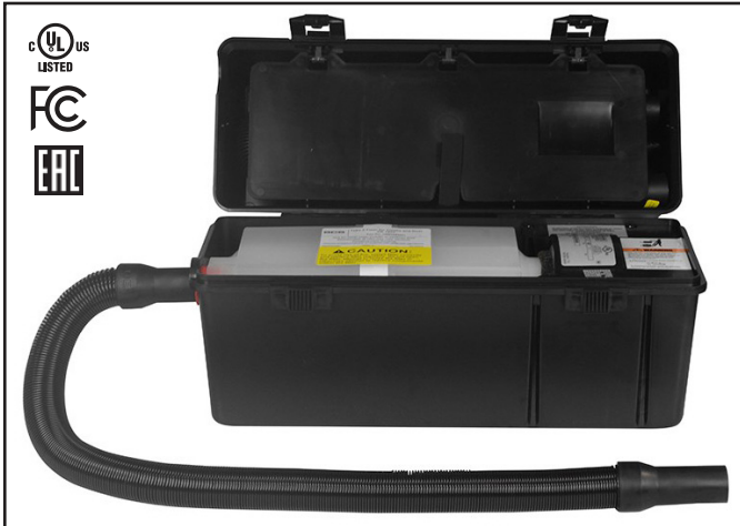
Figure 1. SCS 497 Electronic Service Vacuum