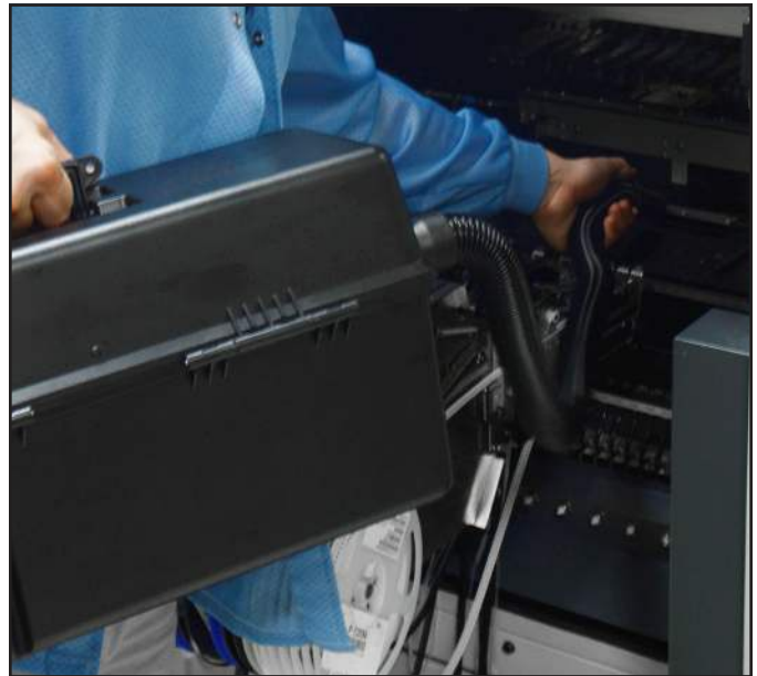
Figure 3. Using the 497 Electronic Service Vacuum

Use the power switch to power the vacuum ON. Use the carrying handle or SV-CS1 carrying strap to carry and transport the vacuum.