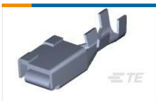
TE Part #1318986-2 DYNAMIC D-5 REC CONT SS L/P AU