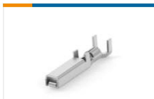
TE Part #175287-2 Contact: Component To Wire; 15A, 28-14 wire size