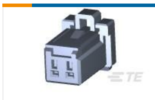
TE Part #1-1871465-2 DYNAMIC 1200S REC HSG 2P X BLA