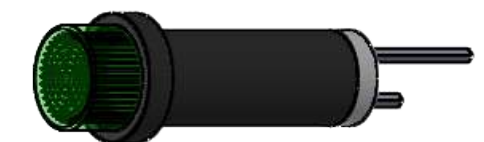
ISOMETRIC VIEW ONLY FOR REF.

The information in this document is the exclusive PROPRIETARY property of VISUAL COMMUNICATIONS COMPANY, LLC. It is disclosed with the understanding that acceptance or review by the recipient constitutes an undertaking by the recipient: (1) to hold this information in strict confidence (2) not to disclose, duplicate, copy, or use the information, in whole or in part, for any purpose other than that for which disclosed