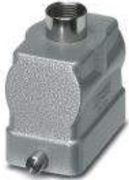
HEAVYCON B10 sleeve housing, for single locking latch, height: 56 mm, with 1 x Pg16 gland, straight cable outlet

Please be informed that the data shown in this PDF Document is generated from our Online Catalog. Please find the complete data in the user's documentation. Our General Terms of Use for Downloads are valid ( http://download.phoenixcontact.com )