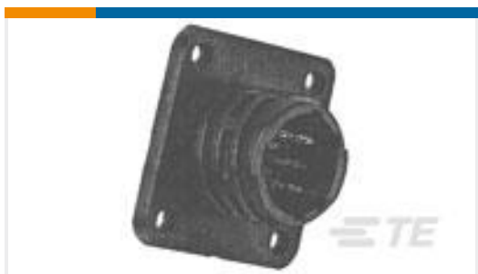
TE Part #205841-3 CPC RECPT ASSEMBLY SIZE 11-8