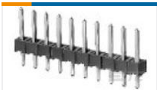
TE Part #5-146280-8 08 MODII HDR SRST B/A .100CL