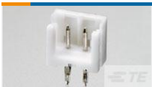
TE Part #177537-3 2.5 M.I.S POST HDR ASSY 3P