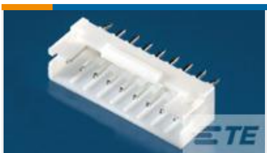
TE Part #1-1735446-2 2MM PITCH HPI POST HEADER, VERTICAL, 12P