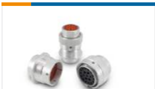
TE Part #HD36-18-20SN DEUTSCH HD30 Housings