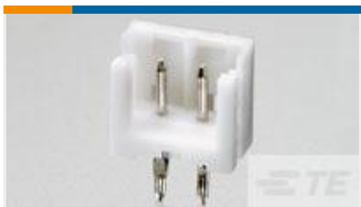
TE Part #177537-2 2.5 M.I.S. POST HDR ASSY 2P