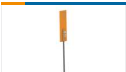
TE Part #2344657-2 FPC ANTENNA, CABLE, MHF, WI-FI TRIPLE