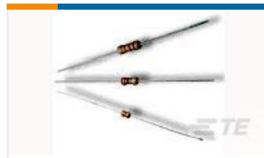
TE Part #1-1623931-9 CFR25 5% 39R