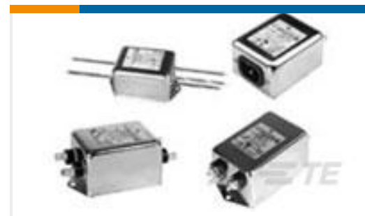
TE Part #1-6609032-0 5VR3=F7203 S0