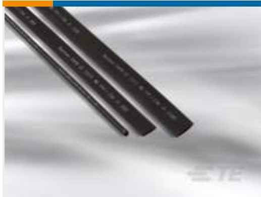
TE Part #EM7502-000 X4-2.0-0-SP-SM