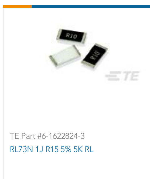
TE Part #6-1622824-3 RL73N 1J R15 5% 5K RL