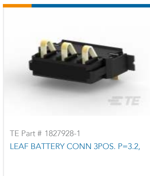
TE Part # 1827928-1 LEAF BATTERY CONN 3POS. P=3.2,