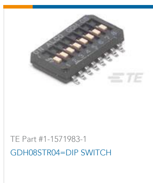
TE Part #1-1571983-1 GDH08STR04=DIP SWITCH