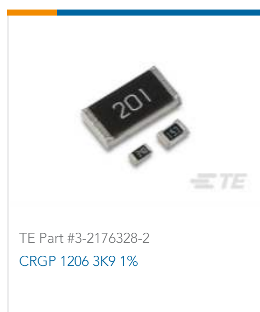
TE Part #3-2176328-2 CRGP 1206 3K9 1%