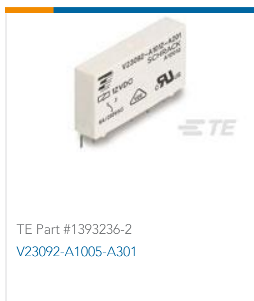
TE Part #1393236-2 V23092-A1005-A301