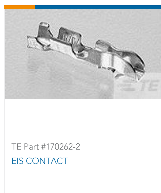
TE Part #170262-2 EIS CONTACT