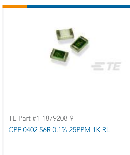
TE Part #1-1879208-9 CPF 0402 56R 0.1% 25PPM 1K RL