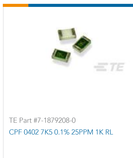
TE Part #7-1879208-0 CPF 0402 7K5 0.1% 25PPM 1K RL