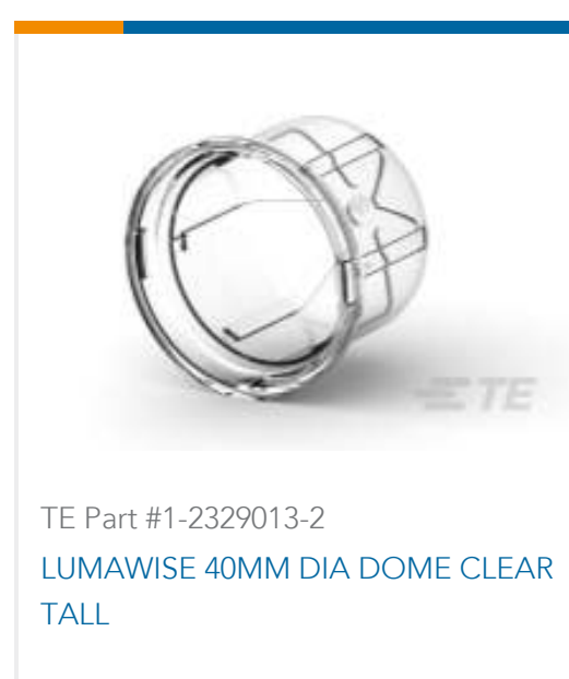
TE Part #1-2329013-2 LUMAWISE 40MM DIA DOME CLEAR TALL