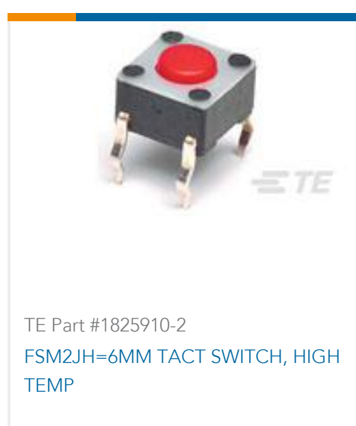
TE Part #1825910-2 FSM2JH=6MM TACT SWITCH, HIGH TEMP