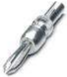
Test plugs, Color: silver