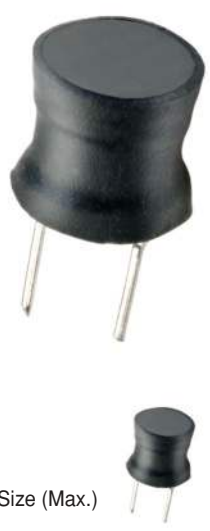
Actual Size (Max.)