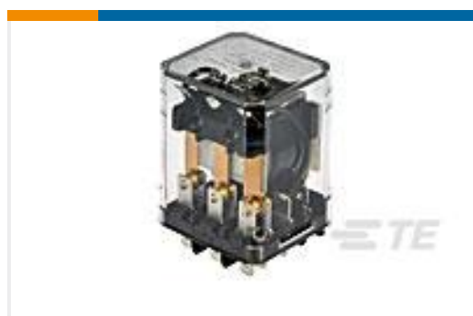
TE Part #2-1393118-6 KUP-14D35-110=KU