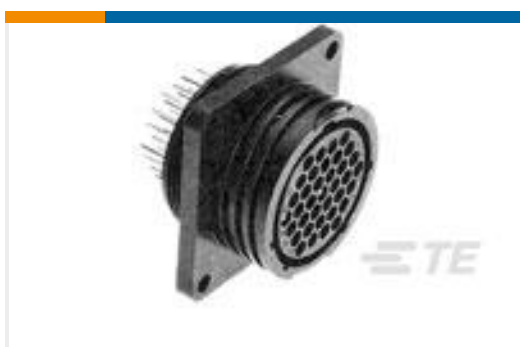
TE Part #2-208224-1 CPC RECPT ASSEMBLY SIZE 23-37