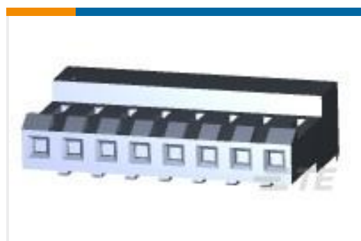
TE Part #3-640428-8 08P MTA156 CONN ASSY 22AWG RED