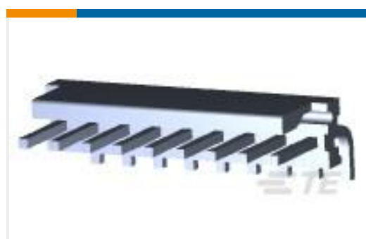
TE Part #640389-9 09P MTA156 HDR ASSY SQ R/A F/L