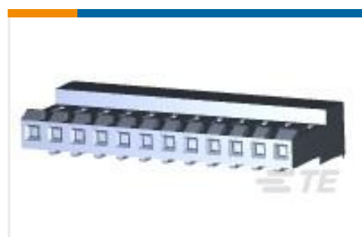
TE Part #4-640428-2 12P MTA156 CONN ASSY 22AWG RED