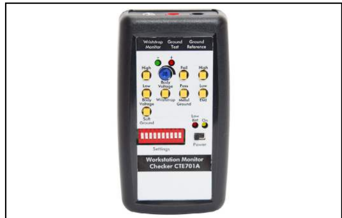
Figure 3. SCS CTE701 Workstation Monitor Checker

The checker verifies the proper operation of dual wrist strap monitoring. Connect a 3.5 mm test cable to both the checker and to the operator jack of the monitor. At this point the monitor should indicate failure. Depress the Pass button on the wrist strap section. The monitor should indicate a good connection. While pressing the Pass button, press body voltage “high.” At this point the Wrist Strap LED would be blinking red.