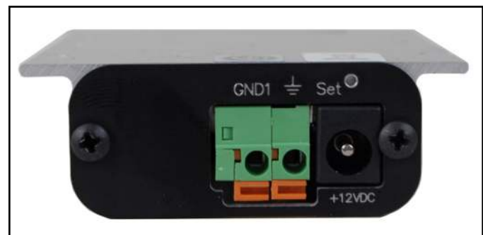
Figure 2. Rear view of Wrist Strap and Ground Monitor

Attach 18 AWG wires to the unit as described below. Strip back the vinyl insulation at each end of the wires to approximately 1/3 inch (8 mm). Twist the stranded wire on each end before inserting the wire into each connector location. In order to attach the wire, insert a small blade screwdriver into the orange slot above. Gently push inward and insert the stripped wire fully into the hole in the green connector. Hold the wire fully in and release the screwdriver to allow the wire to catch. Attach the green monitor ground cord to the ground connector on back of unit. Attach the impedance monitor wire to the “GND1” connector on the back of the unit.