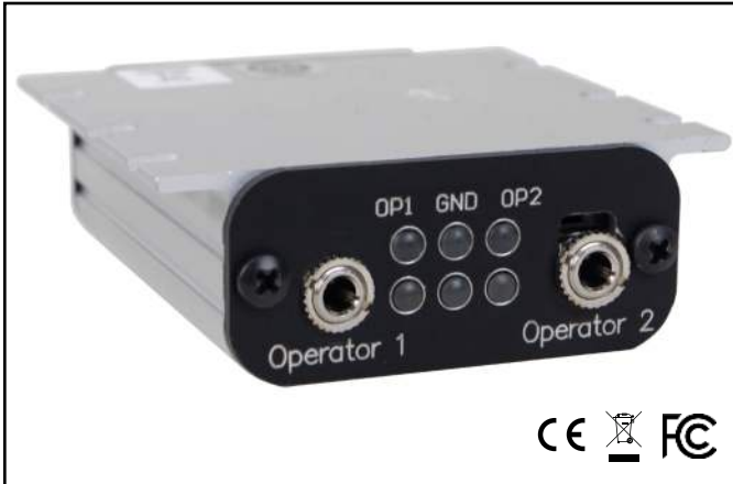
Figure 1. SCS CTC337 Wrist Strap and Ground Monitor