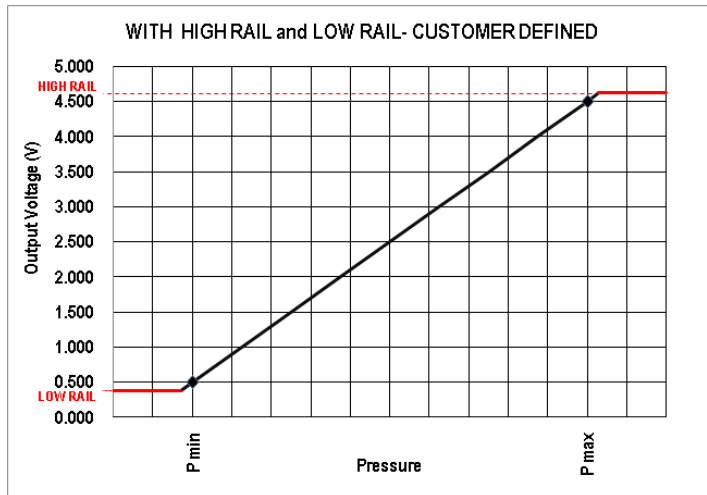
OEM Custom Calibration High/Low Rail values can be adjusted by circuit