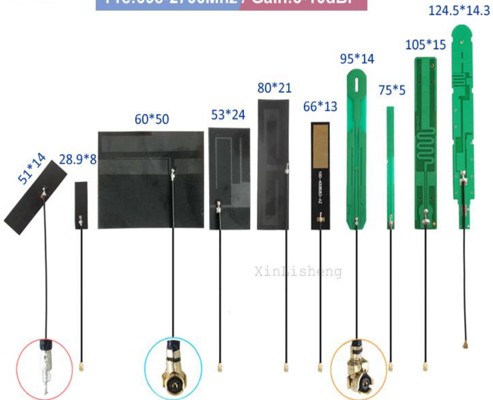
Connector: Strip/Ipex/Mhf4 or customized cable:3/4/5/10/12/15/20cm etc