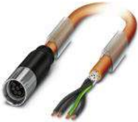
Cable plug in molded plastic, Length: 5 m, Color of outer sheath: orange RAL 2003

Please be informed that the data shown in this PDF Document is generated from our Online Catalog. Please find the complete data in the user's documentation. Our General Terms of Use for Downloads are valid ( http://phoenixcontact.com/download )